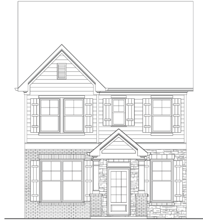
Elevation A 2 car garage