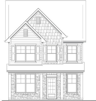
Elevation B 2 car garage